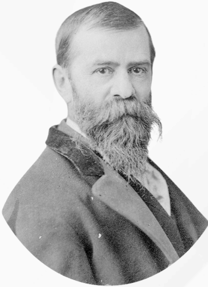
Jervis McEntee, circa 1874